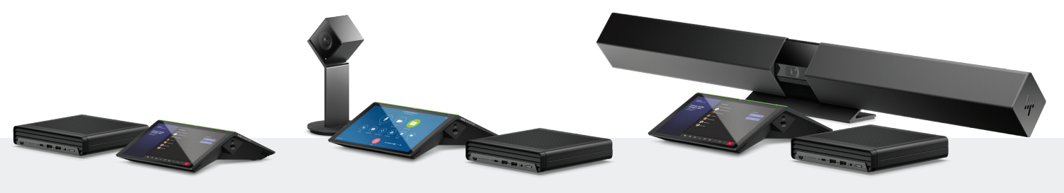
HP Presence Small Space Solution<sup>16</sup>