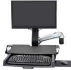
SV Combo Arm with Worksurface and Pan