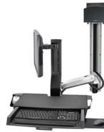
SV Combo Arm System with Worksurface and Pan (small CPU holder)