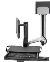
SV Combo Arm System with Worksurface and Pan (medium CPU holder)