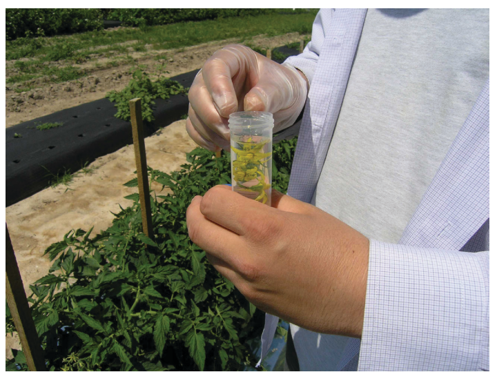
Figure 4. Placing tomato flowers in vials with 70% alcohol.

Because the native flower thrips occur in large numbers in the flowers of fruiting vegetables where they out-compete the damaging invasive species, it is necessary to accurately identify the species in order to make management decisions. A few flowers should periodically be placed in a small container with 70% alcohol (Figure 4). The container can be shaken to dislodge the thrips, which can then be examined under a microscope with at least 40X magnification to determine the species of the adults. Shifts in the relative abundance of species of thrips throughout the growing season can be determined in this way. It is best for growers to have a competent scout who can provide this service. Contact your local UF/IFAS Extension agent for advice and help.