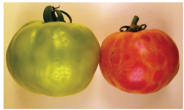
Figure 1. Tomato spotted wilt symptoms on fruit of tomato.

TSWV is circulative and replicative, which means that the virus is circulated by the insect hemolymph (blood) and replicates in the insect's internal tissues. The cycle of virus acquisition and transmission begins with larval feeding on infected plant tissue (de Assis Filho et al. 2005). The virus passes through the midgut of the insect and spreads to various cells and organs, including the salivary glands. The virus is transmitted to an uninfected plant when saliva is injected into the plant tissue during feeding (Figure 1).