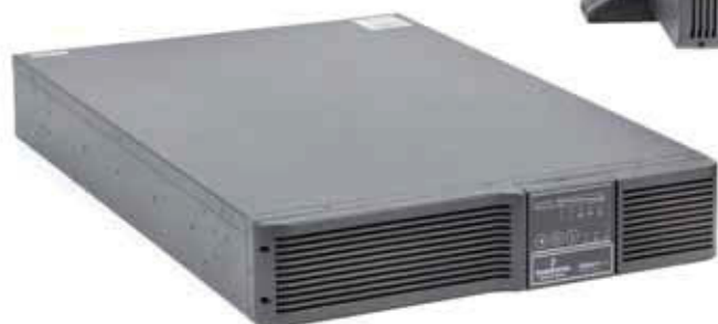
PSI XR 2U Rack version