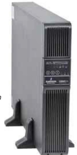
PSI XR 2U Tower version