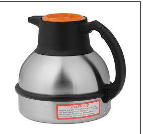
THERMAL CARAFE,ORN 1.9L 1PK