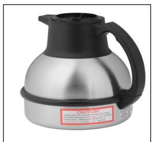
THERMAL CARAFE,ORN 1.9L 12PK