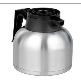
CARAFE,SST 1.9L SHRT BLK 1