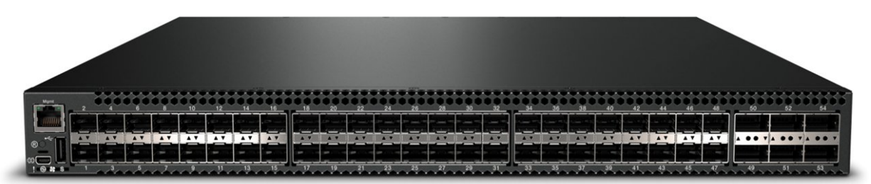
Figure 1. Lenovo RackSwitch G8272

The RackSwitch G8272 is shown in the following figure.