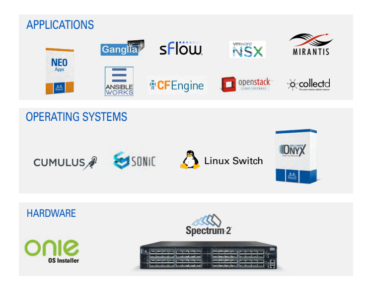
Figure 1. Open Ethernet Operating System and Hardware

With a range of system form factors, and a rich software ecosystem, SN3000 series allows you to pick and choose the right components for your data center.