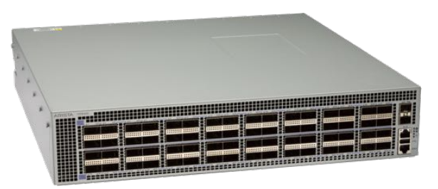
Arista 7170-64C: 64x 100GbE QSFP100 ports, 2 SFP+ ports