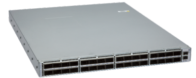
Arista 7050PX4-32S: 32x 400G OSFP ports, 2 SFP+ ports

The 7050PX4-32S is a 1RU system with 32 400G OSFP ports offering wire speed throughput of up to 12.8Tbps bi-directional. Each OSFP 400G port supports a choice of 7 speeds with flexible configuration between 400GbE, 200GbE, 100GbE, 50GbE, 40GbE, 25GbE and 10GbE modes for up to 128 ports of 10GbE and 25GbE or 144 ports of 50GbE or 64 ports of 200GbE using breakouts. All ports can operate in any supported mode without limitation, allowing easy migration from lower speeds and the flexibility for leaf or spine.