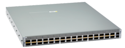
Arista 7050DX4-32S: 32x 400G QSFP-DD ports, 2 SFP+ ports

The 7050DX4-32S is a 1RU system with 32 400G QSFP-DD ports offering wire speed throughput of up to 12.8Tbps bi-directional. Each QSFP-DD port supports a choice of 7 speeds with flexible configuration between 400GbE, 200GbE, 100GbE, 50GbE, 40GbE, 25GbE and 10GbE modes for up to 128 ports of 10GbE and 25GbE or 144 ports of 50GbE or 64 ports of 200GbE using breakouts. All ports can operate in any supported mode without limitation, allowing easy migration from lower speeds and the flexibility for leaf or spine deployment.