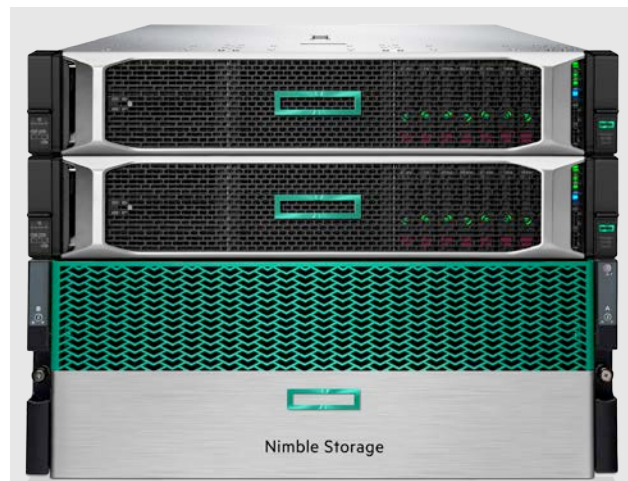
HPE Nimble Storage dHCI

With HPE Nimble Storage dHCI, enterprises can run faster with rack-to-apps in less than 15 minutes, end the fire-fighting with predictive analytics delivering 99.9999% data availability by HPE Nimble Storage, and optimize everything with higher productivity and maximum resource efficiency.