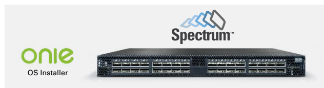
Figure 1. Open Ethernet Operating System and Hardware