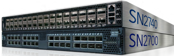
Front side view

The Mellanox SN2000 series come in three different configurations. All powered by the Spectrum™ ASIC, each configuration delivers high performance combined with feature-rich layer 2 and layer 3 forwarding, suited for both top-of-rack leaf and fixed configuration spines.