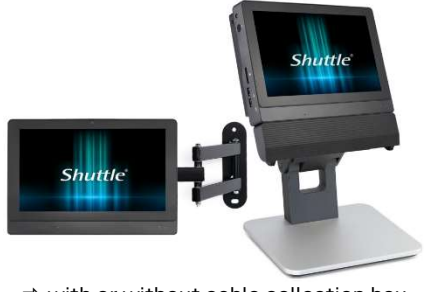
\Rightarrow with or without cable collection box