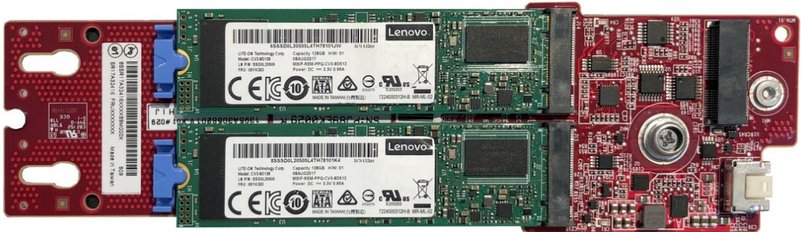
Figure 3. SATA/NVMe M.2 Module with 2 drives

The following figure shows the SATA/NVMe M.2 Module with two 128 GB M.2 drives installed. Note that the production M.2 Module has a green circuit board, not the red color as shown here.