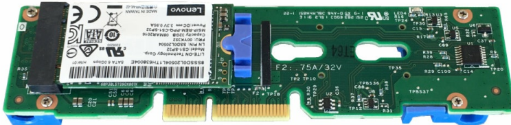
Figure 2. Single M.2 Adapter and a 32 GB M.2 drive

The Single M.2 Adapter is shown in the following photo, with the 32GB M.2 drive installed.