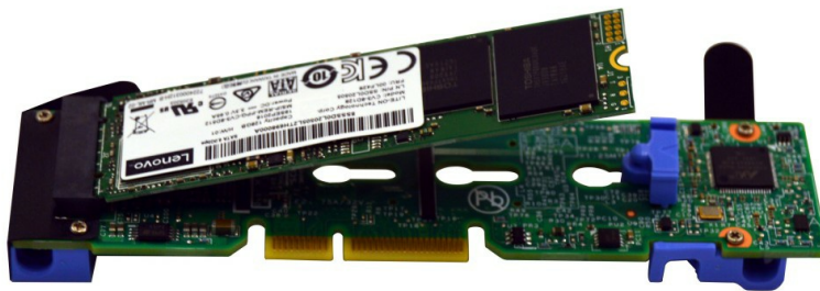
Figure 1. Dual M.2 Adapter and a 128 GB M.2 drive

One example is the Dual M.2 Adapter, as shown in the following figure, with one 128GB M.2 drive partially inserted. The second M.2 drive is installed on the other side of the adapter.