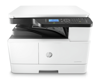
HP LaserJet MFP M439n

Surpass your office printer expectations with the speed, quality, and efficiency of the M439 series office printers.