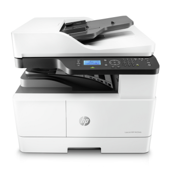
HP LaserJet MFP M439nda