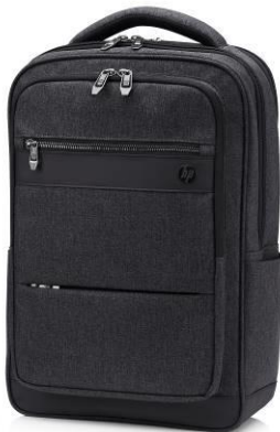
HP Executive 15.6 Backpack 6KD07AA