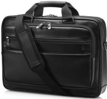
HP Executive 15.6 Leather Top Load 6KD09AA