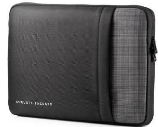
HP Slim Sleeve 15.6 F8A00AA