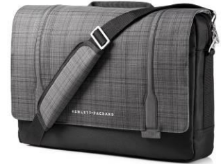
HP Slim Messenger F3W14AA