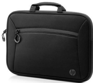
HP Black 11.6" Sleeve 3NP78AA