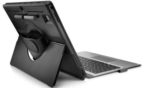
HP Elite x2 1013 G3 Healthcare Case 4LR29AA