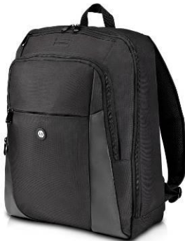
HP Essential Backpack H1D24AA