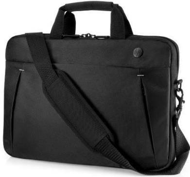
Specs: HP 14.1 Business Slim Top Load 2SC65AA