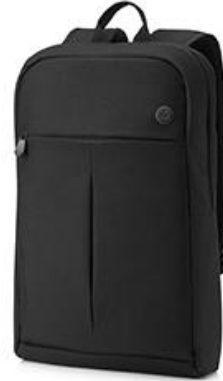
HP 15.6 Prelude Backpack 2MW63AA