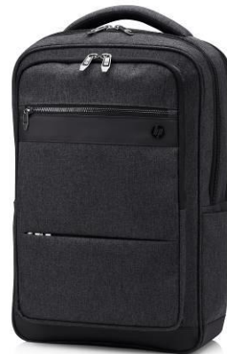
HP Executive 17.3 Backpack 6KD05AA