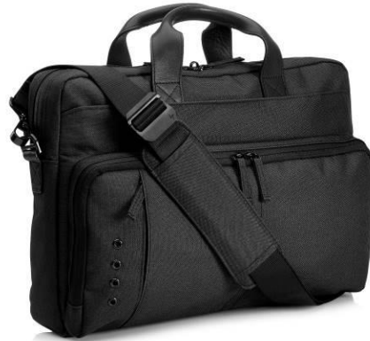
HP Power Ready 14.1 Elite Top Load 4NR35AA