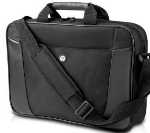
HP Essential Top Load Case H2W17AA