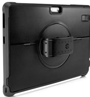
HP x2 612 G2 Rugged Case Z7T26AA