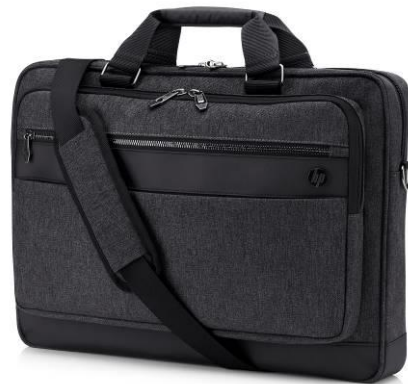
HP Executive 17.3 Top Load 6KD08AA