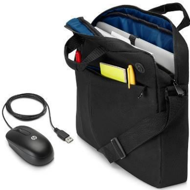
HP Prelude Top Load and HP USB Mouse Bundle 2MW64AA