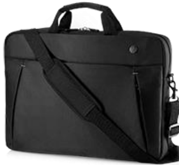
HP 17.3.1 Business Slim Top Load 2UW02AA