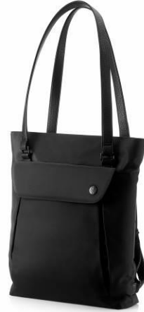
HP 15.6" Ladies Convertible Tote 3NP79AA