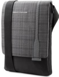
HP Slim Tablet Sling 12 F7Z97AA