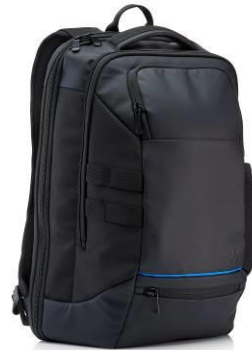
HP Recycled Series 15.6" Backpack 5KN28AA