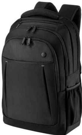
HP 17.3 Business Backpack 2SC67AA