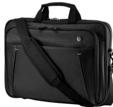
HP 15.6 Business Top Load 2SC66AA