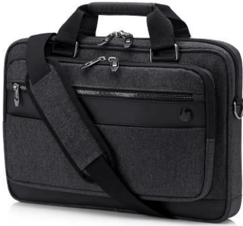
HP Executive 14.1 Slim Top Load 6KD04AA