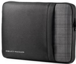
HP Slim Sleeve 12.5 F7Z98AA