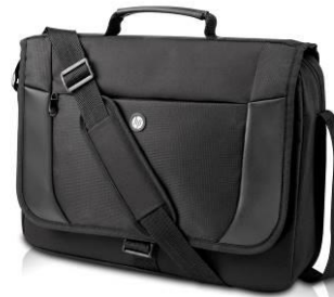
HP Essential Messenger Case H1D25AA