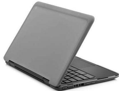
HP Chromebook x360 11 G1 EE Protective Case 1JS01AA