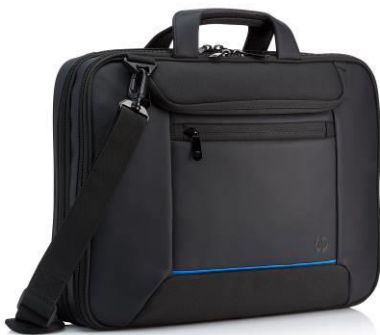
HP Recycled Series 15.6" Top Load 5KN29AA