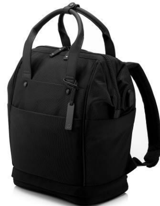
HP Convertible 14.1 Tote 5KN27AA