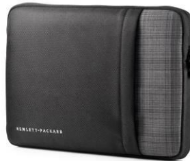
HP Slim Sleeve 14.1 F7Z99AA