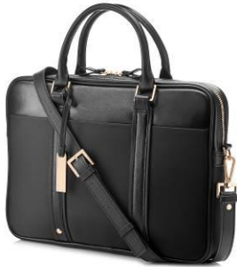
HP Ladies 14.0" Slim Top Load 2JB97AA