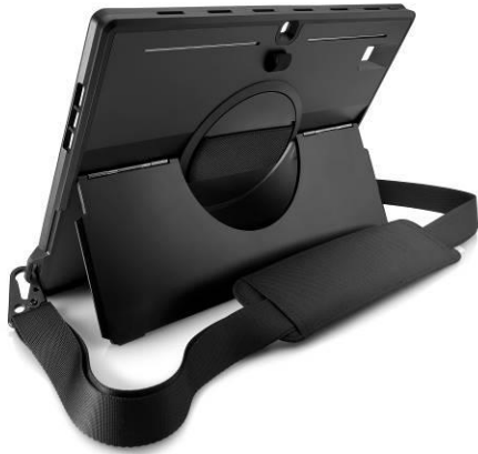
HP Elite x2 1013 G3 Protective Case 4LR28AA