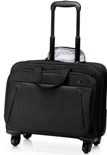
HP Business 4 Wheel Roller Case 2SC68AA