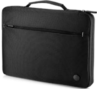
HP 13.3 Business Sleeve 2UW00AA