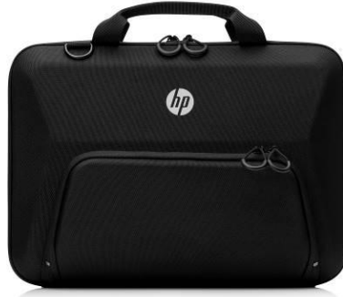
HP Black Always On 14.0 Case 3YF54AA