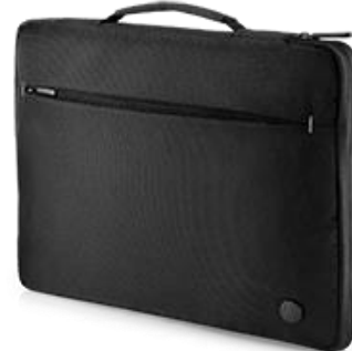
HP 14.1 Business Sleeve 2UW01AA