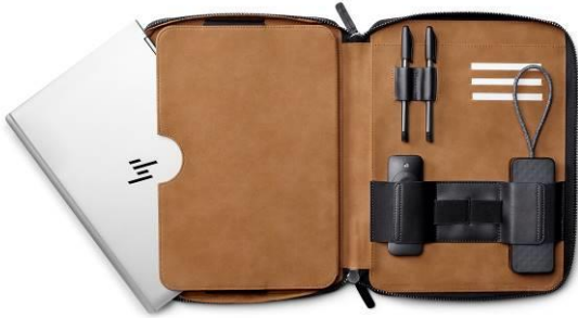
HP Elite Notebook Portfolio 4SZ25AA