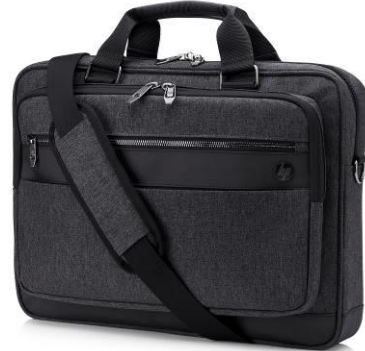
HP Executive 15.6 Top Load 6KD06AA