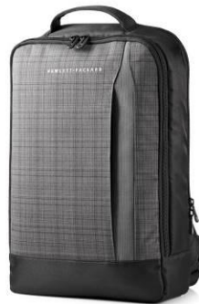
HP Slim Backpack F3W16AA