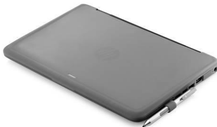
HP ProBook x360 11 G1 EE Protective Case 1JS00AA