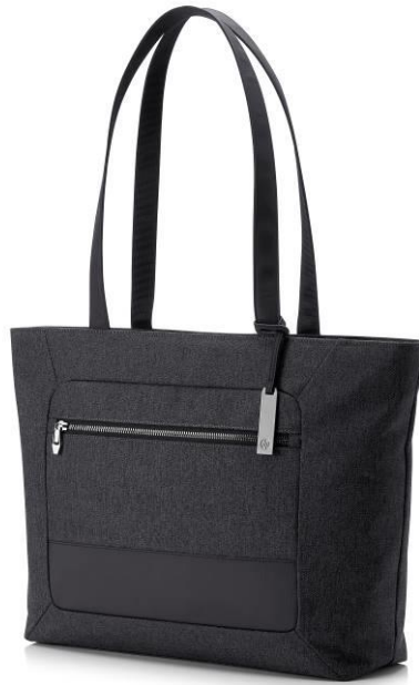
HP Executive 14.1 Tote 6KD10AA