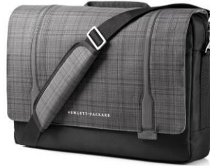
HP Slim Top Load Case F3W15AA