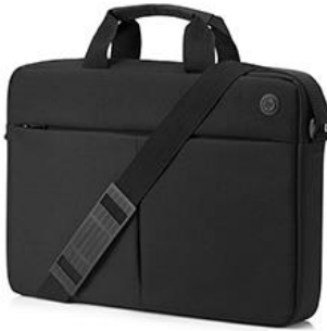
HP 15.6 Prelude Top Load 2MW62AA