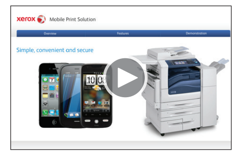
Visit www.xerox.com/MobileDemo to view a demo of the Xerox<sup>®</sup> Mobile Print Solution.

cloud is offered as a free service or a more advanced for-fee solution. The Basic version offers a ConnectKey® App resident on the user panel and enables a simple email to the cloud to pull print jobs to the multifunction printer. The Enhanced version offers the app with a Mobile Print Cloud license, providing convenient authentication that locks and unlocks a device, via a mobile app, without authentication cards.