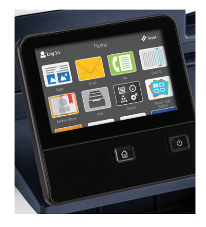
View a demo of our VersaLink device touchscreen at www.xerox.com/ VersaLinkUIDemo.

This unmatched balance of hardware technology and software capability helps everyone who interacts with our VersaLink printers and multifunction printers get more work done, faster.