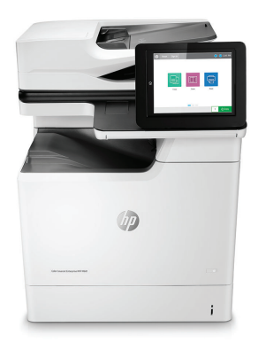
HP Color LaserJet Enterprise MFP M681dh

This HP Color LaserJet MFP with JetIntelligence combines exceptional performance and energy efficiency with professional-quality documents right when you need them—all while protecting your network with the industry's deepest security.