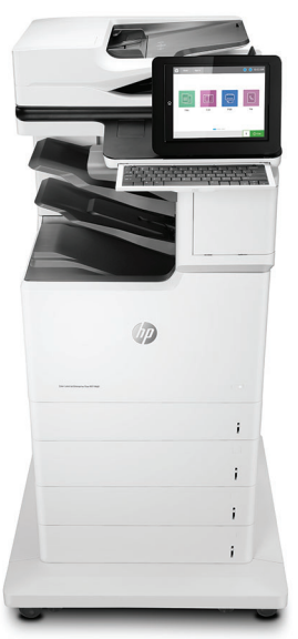
HP Color LaserJet Enterprise Flow MFP M681z