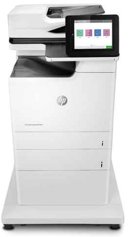
HP Color LaserJet Enterprise MFP