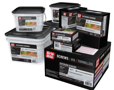
Grip-Rite Exterior Screws with PrimeGuard® 10 coating Available in 1lb., 5lb., 10lb., 25lb. and bulk packages