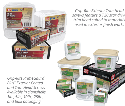
Grip-Rite PrimeGuard Plus® Exterior Coated and Trim Head Screws Available in clamshells, 1lb., 5lb., 10lb., 25lb., and bulk packaging