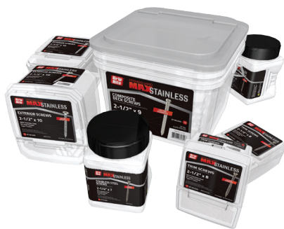
NEW — Grip-Rite PrimeGuard MAX® STAINLESS Available in clamshells, jars, 1lb., 5lb., 25lb. and bulk packages

Grip-Rite exterior screws with PrimeGuard coating are a reliable choice for contractors and DIYers who want quality and value from a brand they know and trust. With a Phillip's head, coarse thread and a sharp point, all wrapped in a 10-year coating warranty, this fastener is ideal for use in treated lumber projects.