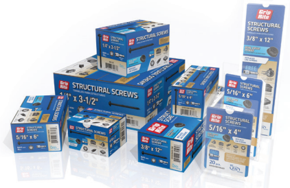
NEW — Grip-Rite Structural Screws Peg hooked clamshells, 50 pc. boxes, 150-200 pc. boxes, and bulk packaging. Actual quantities may vary based off screw size

From the brand you know and trust, Grip-Rite Structural Screws offer versatility, speed and longevity for your load-bearing exterior wood construction projects. Grip-Rite's exclusive Dual Drive Power head brings flexibility to the jobsite with a unique, combined Hex Washer/Star Drive recess head, allowing you to choose the included hex driver or a star drive bit to fasten the screw. A 3-digit, ICC recognized code is stamped right into the head for easy spec reference and a load value chart is conveniently located on every package. As a replacement for lag screws, Grip-Rite Structural Screw type 17 tip offers both efficiency and time savings by eliminating the need to pre-drill pilot holes. Grip-Rite premium PrimeGuard Plus coating offers the assurance these screws will last throughout the lifetime of a project.