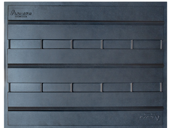
Durable, multi-panel construction outperforms single-piece design every time