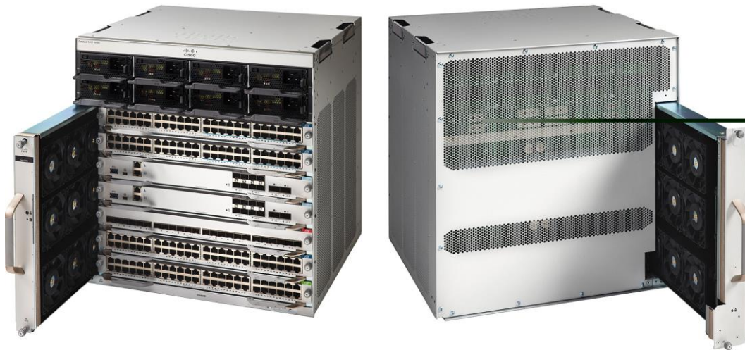
Figure 2. Dual serviceable fan tray

Each Cisco Catalyst 9400 Series uses dual serviceable fan trays for cooling. Cisco Catalyst 9400 can optionally be accessed from the rear for flexible cable management. The chassis is enterprise closet-optimized with side-to-side airflow. All fan trays are composed of multiple independently controlled fans with N+1 redundancy. If any single fan fails, the system will continue to operate without a degradation in cooling. Speeds of fans change dynamically to compensate for fan failure. Catalyst 9400 Series fans have a barometric sensor, which allows slower fan speed curves at lower altitudes. Catalyst 9400 Series fans also have individual fan Pulse-Wide Modulation (PWM) fine-tuning to reduce variability in fan Revolutions Per Minute (RPM) under throttled conditions. This allows for optimal acoustic performance at 60dB when the system is operating at 50% load.