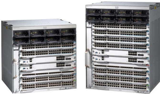
Figure 1. Cisco Catalyst 9400 Series

Cisco ONE for Access lets you manage your entire switching structure as a single, converged component. With one management system and one policy for wired and wireless networks, it offers an efficient way to provide more secure access.