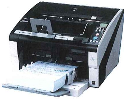
A4 Landscape at 300 dpi 100 ppm / 200 ipm A4 Portrait at 300 dpi 85 ppm / 170 ipm Scan mixed batches through the 500 sheet hopper