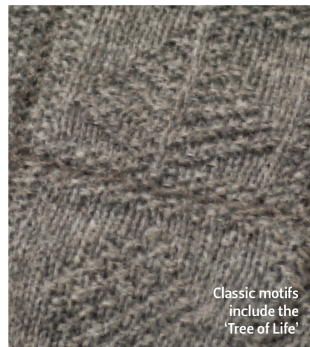
Classic motifs include the 'Tree of Life'

Row 7: K1, P1, K1, P to last 5 sts, P2tog, K1, P1, K1.