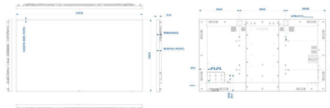
Philips 98BDL4150D www.philips.com