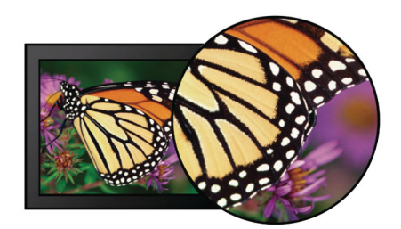
Picture quality matters. Regular displays deliver quality, but you expect more. This display

features enhanced Full HD 1920 x 1080 resolution. With Full HD for crisp detail paired with high brightness, incredible contrast and realistic colors expect a true to life picture.