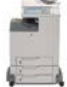
4730 MFP/ CM4730 MFP