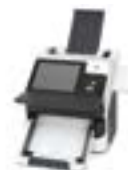
Scanjet Enterprise 7000n/nx Document Capture Workstation