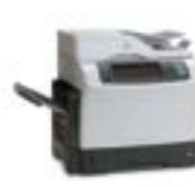
4345 MFP / M4345 MFP