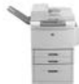
M9040 MFP / M9050 MFP