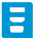
Displayport, HDMI, VGA