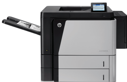
HP LaserJet Enterprise M806dn Printer

This HP LaserJet handles big print jobs fast, with extra-large input capacity and versatile paper-handling options. Mobile printing is simple with wireless direct printing and touch-to-print technology. Easy upgrades protect your investment. 1, 2