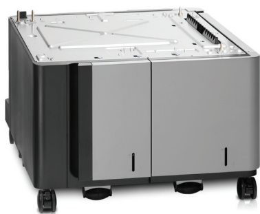
HP LaserJet 3500 sheet HCL and Stand (C3F79A)

1 HP Auto-On/Auto-Off Technology capabilities subject to printer and settings; may require a firmware upgrade.