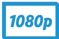
Full HD Resolution