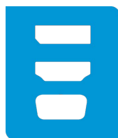
DisplayPort, HDMI, VGA