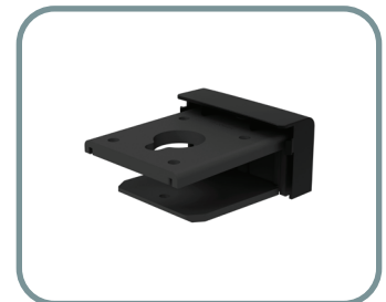
Low-Profile Top Mount C-Clamp, 25–35 mm 98-479-216 (white) 98-479-224 (matte black)

Download additional literature at ergotron.com/pro