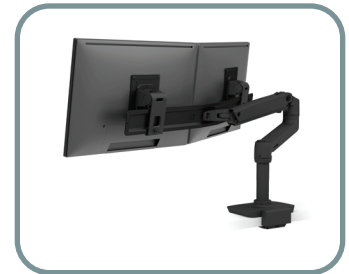
LX Dual Direct Arm, Low-Profile Top Mount C-Clamp 45-609-216 (white) 45-609-224 (matte black)