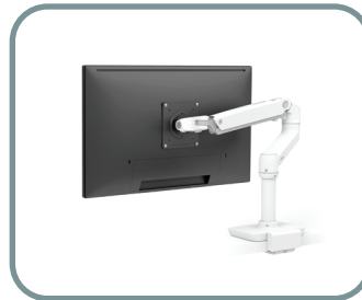
LX Desk Arm, Low-Profile Top Mount C-Clamp 45-608-216 (white) 45-608-224 (matte black)