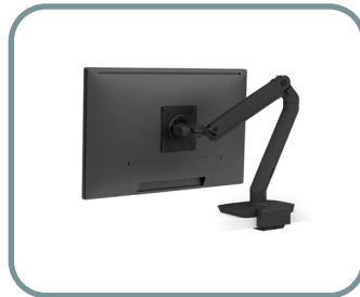
MXV Desk Arm, Low-Profile Top Mount C-Clamp 45-607-216 (white) 45-607-224 (matte black)