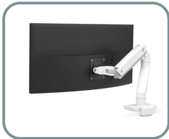
HX Desk Arm, Low-Profile Top Mount C-Clamp 45-606-216 (white)