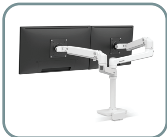
LX Dual Stacking Arm, Low-Profile Top Mount C-Clamp 45-610-216 (white) 45-610-224 (matte black)