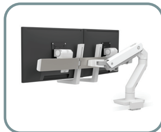
HX Dual Monitor Arm, Low-Profile Top Mount C-Clamp 45-611-216 (white)