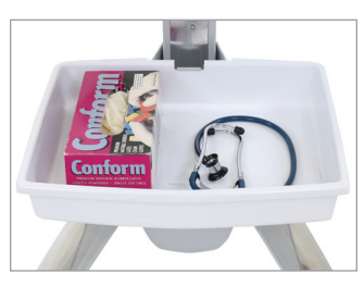
SV Front Tray