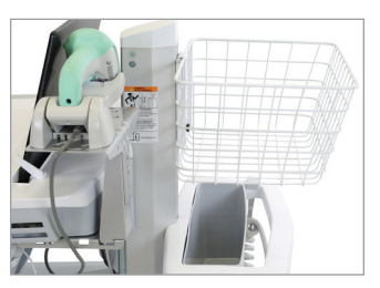
SV Wire Basket, Small