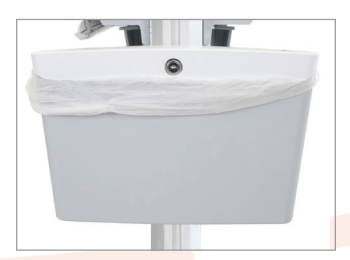
SV Storage Bin