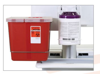
Sharps Container T-Slot Bracket Kit