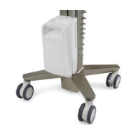
Add-On Power for Non-Powered Carts LiFeKinnex™ Battery 98-246 Smart Battery Dock 98-251 (SG/MY/HK), 98-253 (AU/NZ), 98-255 (JP) Optional LiFeKinnex 4-Bay Charger 98-261 (SG/MY/HK), 98-263 (AU/NZ), 98-265 (JP)