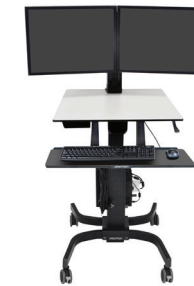
WorkFit™-C LCD LD (Light Duty) 24-215-085 black LCD HD (Heavy Duty) 24-216-085 black Dual 24-214-085 black