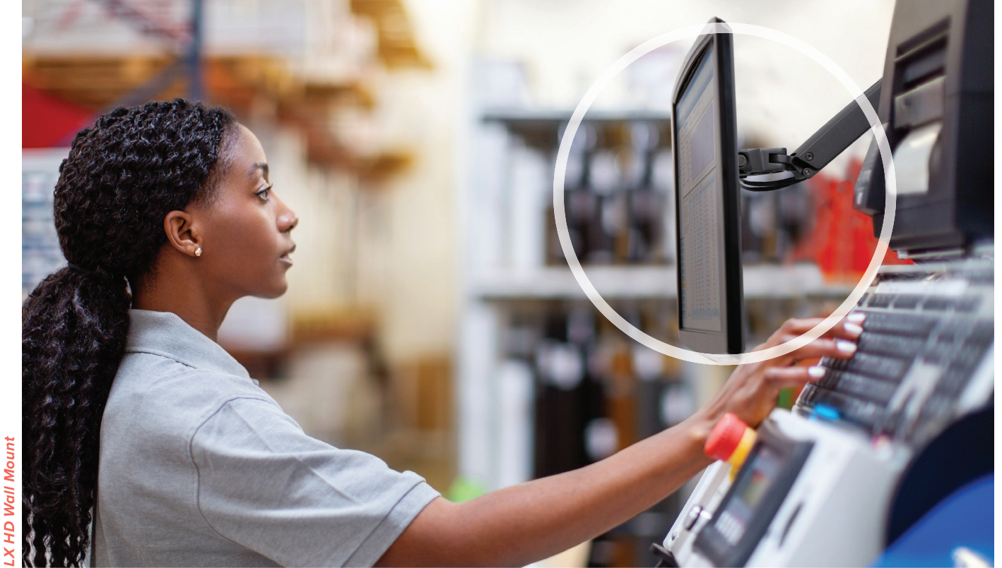
LX HD Wall Mount