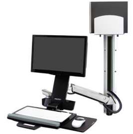
StyleView Sit-Stand Combo System Combo System with worksurface & pan: 45-594-026 Combo Arm, small CPU holder and wall track, polished aluminum Combo System: 45-271-026 Combo Arm, medium CPU holder and wall track, polished aluminum 45-273-026 Combo Arm, small CPU holder and wall track, polished aluminum