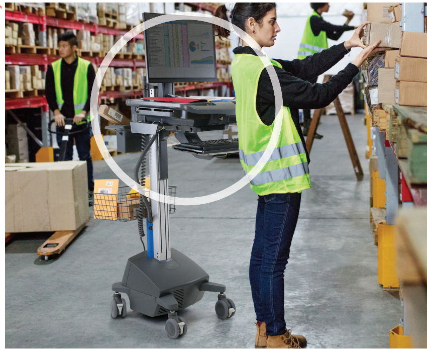
SV42 Dark Grey