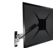
Interactive Arm HD 45-296-026 polished aluminum VHD 45-304-026 polished aluminum