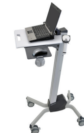
Neo-Flex Laptop Cart 24-205-214 two-tone grey