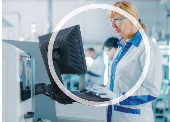
200 Series Combo Arm

With features designed to save time and maximize floor space, Ergotron's professional-grade solutions create flexible workspaces for advanced manufacturing, logistics, back office environments that support efficiency, employee well-being and overall productivity.