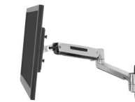
LX Sit-Stand Wall Arm 45-353-026 polished aluminum HD 45-383-026 polished aluminum