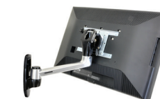
LX HD Wall Mount Swing Arm 45-268-026 polished aluminum Pivot 45-269-009 black