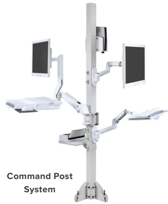
Command Post System