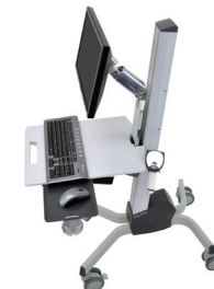
Neo-Flex LCD Cart 24-206-214 two-tone grey