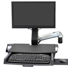
StyleView Sit-Stand Combo Arm Combo Arm with worksurface & pan: 45-583-026 polished aluminum 45-583-216 white Combo Arm: 45-266-026 black head-assembly only, polished aluminum Extender Arm: 45-261-026 polished aluminum