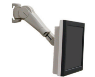
400 Series Wall Mount LCD Arm 45-007-099 grey