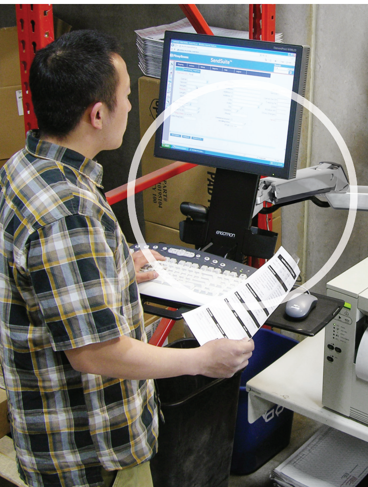
StyleView™ Sit-Stand Combo System