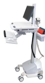
StyleView™ 42 Series LCD pivot version shown Powered with LiFe battery SV42-6302-3 / SG, MY, HK SV42-6302-4 / AU, NZ SV42-6302-5 / CN