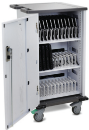
YES30 Basic Charging Cart YES30-LTPCHR-3 / SG, MY, HK YES30-LTPCHR-4 / AU, NZ YES30-LTPCHR-5 / CH