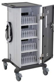
YES35 Charging Cart YES35-TAB-3 / SG, MY, HK