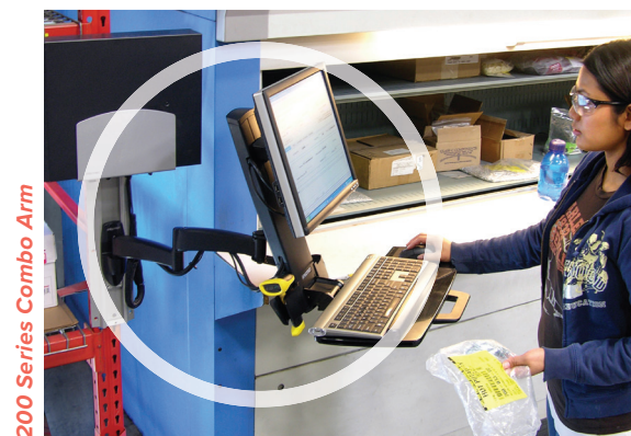
200 Series Combo Arm