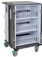
YES36 Charging Cart YESMOR36-3 / SG, MY, HK