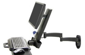
200 Series Combo Arm 45-230-216 white 45-230-200 black