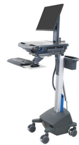
StyleView™ 42 Series LCD pivot version shown Powered with LiFe battery SV42-8302-3 dark grey / SG, MY, HK SV42-8302-4 dark grey / AU, NZ SV42-8302-5 dark grey / CN