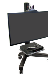
Neo-Flex™ Mobile MediaCenter LD (Light Duty) 24-190-085 black VHD (Very Heavy Duty) 24-191-085 black UHD (Ultra Heavy Duty) 24-192-085 black Camera Shelf Kit 97-491-085