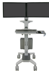
Neo-Flex WideView WorkSpace Dual LCD 24-194-055 two-tone grey