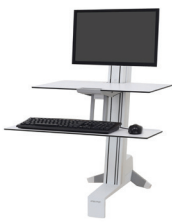
WorkFit-S, Single LD with Worksurface+