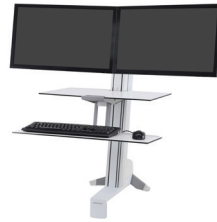
WorkFit-S, Dual Monitor with Worksurface+