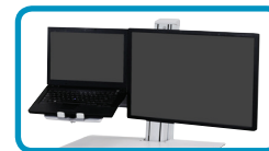
WorkFit Conversion Kit: Dual to LCD & Laptop (white) 97-938-062 Converts a WorkFit-S, Dual into an LCD & Laptop Workstation