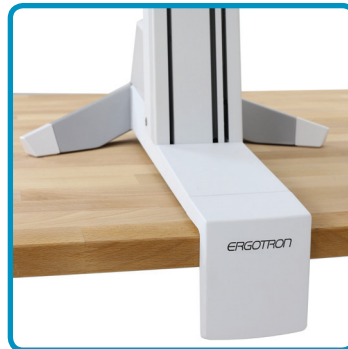
Clamps to the front of surface