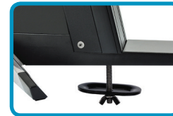
Grommet Mount 97-649-085