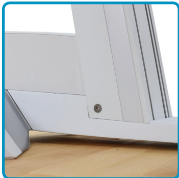
Solid base provides strong stability