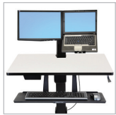
WorkFit-PD LCD & Laptop Kit 97-662 (black)