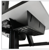
WorkFit-PD Cable Management Box and Cable Wrap Kit 97-667 (black)