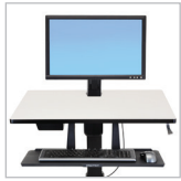
WorkFit-PD Single HD Monitor Kit 97-665 (black)