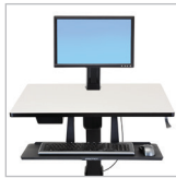
WorkFit-PD Single LD Monitor Kit 97-664 (black)