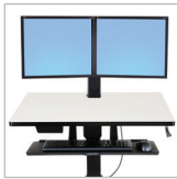
WorkFit-PD Dual Monitor Kit 97-663 (black)