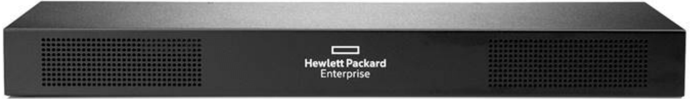
1x1x8 HPE G4 KVM IP Console Switch – Front View