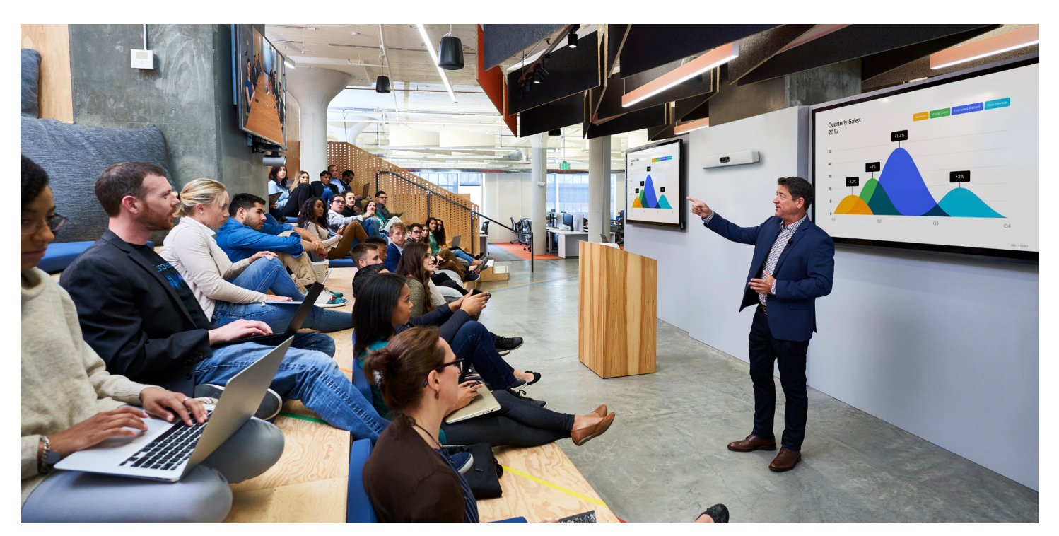
Figure 1. The Webex Room Kit Pro with dual screen setup deployed in auditorium

The Room Kit Pro delivers up to 2160p60 end-to-end UHD video. The codec's rich set of video and audio inputs, flexible media engine, and support for up to three screens enable a variety of use cases, adaptable to your specific needs. The Room Kit Pro can be registered on premises or to the Webex cloud service.