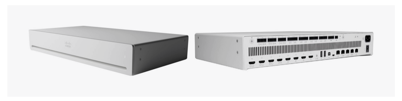
Figure 6. The Webex Codec Pro

The Codec Pro is also available separately as a standalone unit.