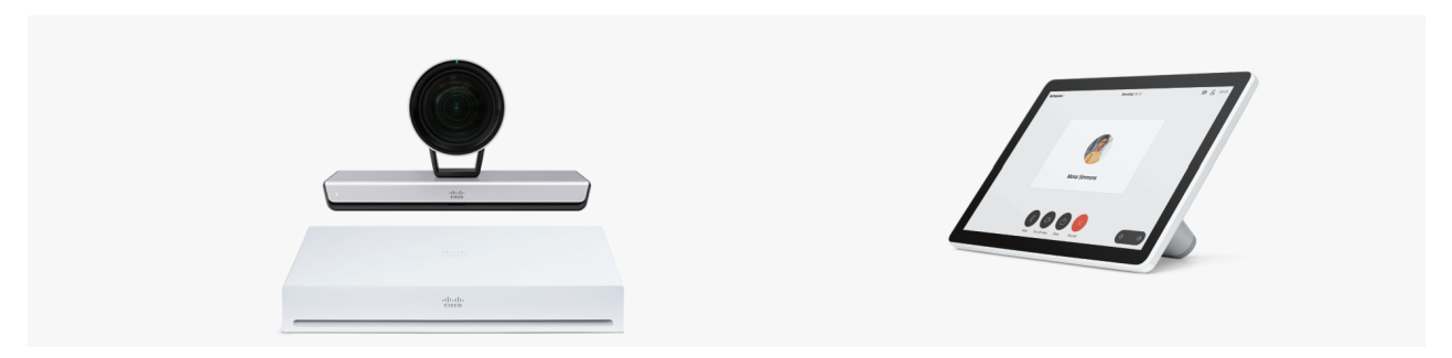
Figure 5. Webex Room Kit Pro Precision 60 integrator package with Codec Pro, the Precision 60 Camera and Webex Room Navigator

The Codec Pro is also available separately as a standalone unit.