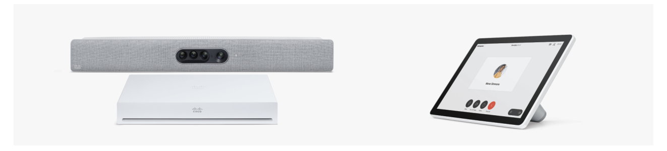
Figure 3. Webex Room Kit Pro integrator package with Codec Pro, Quad Camera and Webex Room Navigator