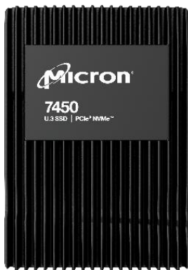
U.3: 7mm and 15mm

Designed as a mainstream solution, the 7450 SSD balances performance and density. Our offering includes a PCIe Gen4, M.2, 22 x 80mm with power-loss protection 4 and a 7.68TB E1.S that delivers industry-leading capacity. 5