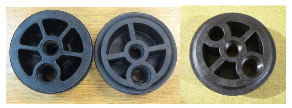
New Style End Cap (From Kit P/N W2T912032)