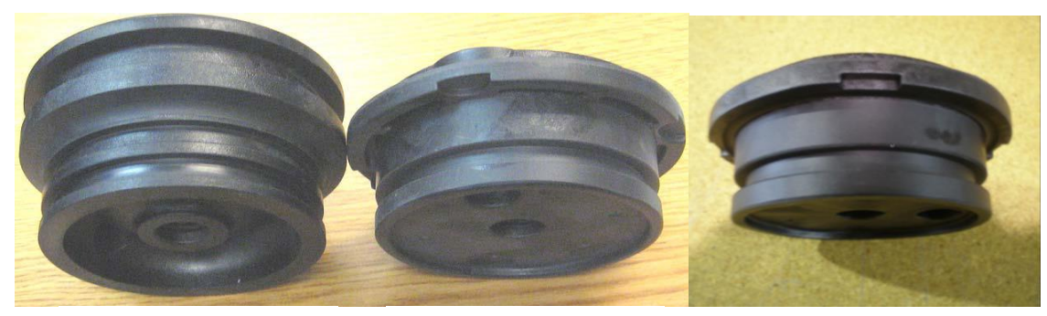
New Style End Cap (From Kit P/N W2T912032)