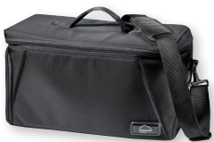
prismaBAG advanced Transport bag for prisma VENT WM 29337