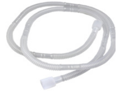
Leakage circuit for mouthpiece ventilation, 15 mm Ø WM 27651