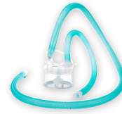
Leakage circuit, heated (i), Auto-fill chamber, 150 cm & 60 cm 15 mm Ø WM 271705 22 mm Ø WM 271704