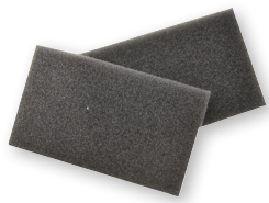
Set of two air filters WM 29928