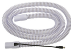
prismaHYBERNITE heated circuit 15 mm Ø WM 29083 22 mm Ø WM 29067