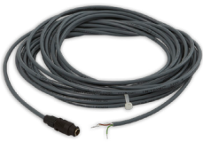
Nurse call connection cable 10 m cable WM 27780 30 m cable WM 27790