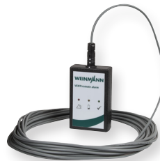
VENTiremote alarm 10 m cable WM 27745 30 m cable WM 27755