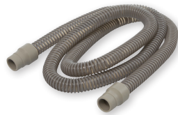
Leakage circuit, 22 mm Ø, autoclavable WM 24667