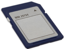
SD card WM 29794