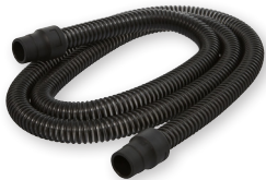
Leakage circuit, 22 mm Ø, black WM 23962