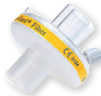
Bacteria filter Teleflex Iso-Gard WM 27591