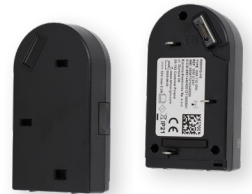
Modem for prisma CLOUD 2G WM 31240