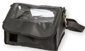
Transport bag for mobile use WM 30633