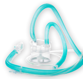
Single circuit with valve, heated (i), Auto-fill chamber, 150 cm & 60 cm 15 mm Ø WM 271707 22 mm Ø WM 271708