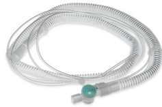
Single circuit with valve 22 mm Ø LMT 27181