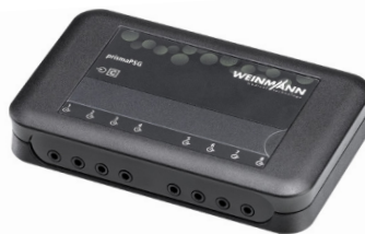
PSG connection cable

Heinen & Löwenstein WM 35151 Löwenstein Medical WM 35152 jack 3.5 mm WM 35153 jack 2.5 mm WM 35154 universal WM 35155