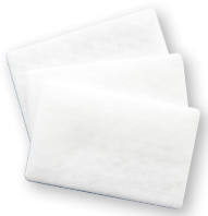
Set of 12 pollen filters WM 29652