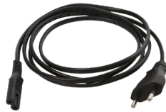
Power cord, angled, ventilation WM 24177