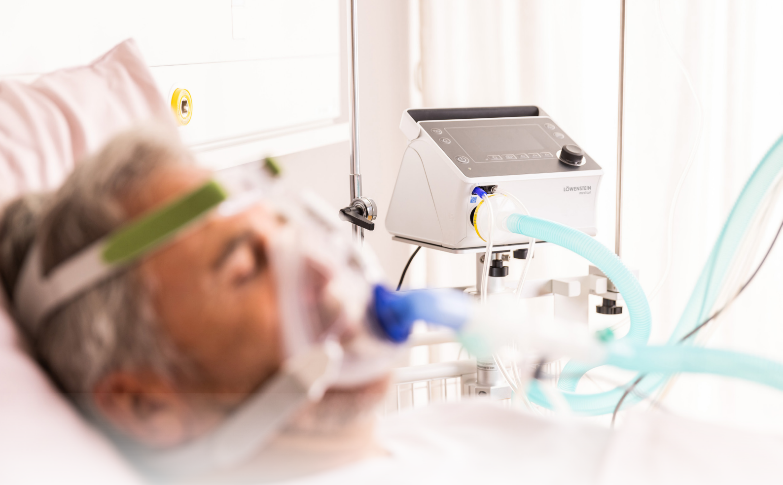
prisma VENT50 and LENA