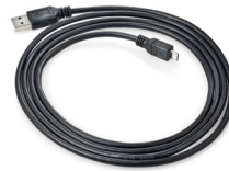
Micro USB 2.0 connection cable 2 m WM 35130