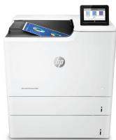
HP Color LaserJet Enterprise M653x