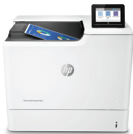
HP Color LaserJet Enterprise M653dn