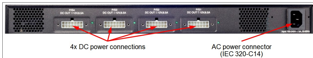
Figure 5. Rear panel of the RackSwitch G7000 RPS option

The rear panel of the RackSwitch G7000 RPS option is shown in the following figure.