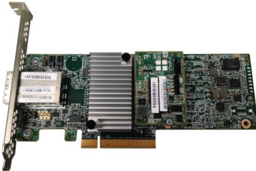
Figure 1. ServeRAID M5225-2GB SAS/SATA Controller

The following figure shows the ServeRAID M5225-2GB SAS/SATA Controller.