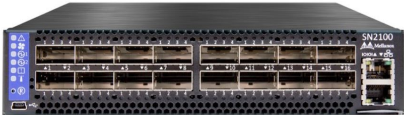
Figure 1. NVIDIA SN2100

The SN2100 is suitable for customers who need faster access to data to support business-critical workloads and applications such as database and analytics, and have a need for seamless transition to 100GbE switching.