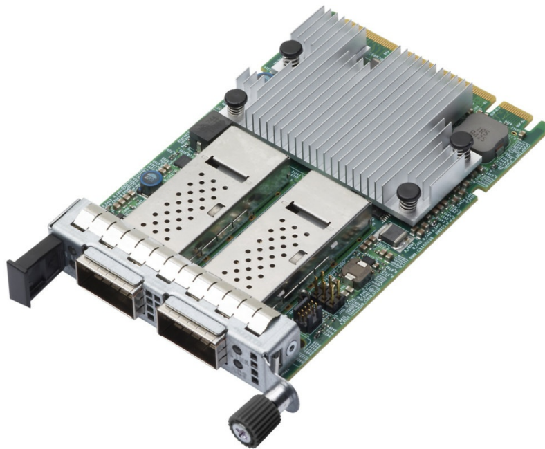
Figure 2. ThinkSystem Broadcom 57508 100GbE QSFP56 2-Port OCP Ethernet Adapter

The following figure shows the OCP adapter: