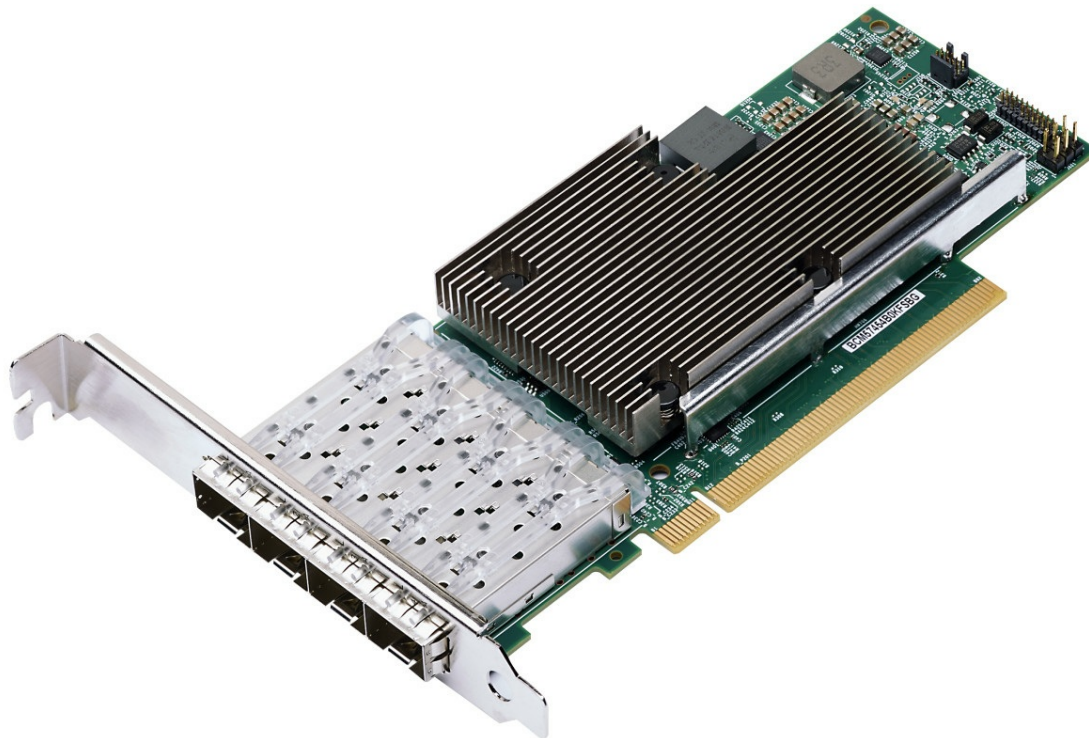
Figure 2. ThinkSystem Broadcom 57454 10/25GbE SFP28 4-port PCIe Ethernet Adapter

The following figure shows the ThinkSystem Broadcom 57454 10/25GbE SFP28 4-port PCIe Ethernet Adapter.