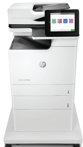
HP Color LaserJet Enterprise MFP M681 f