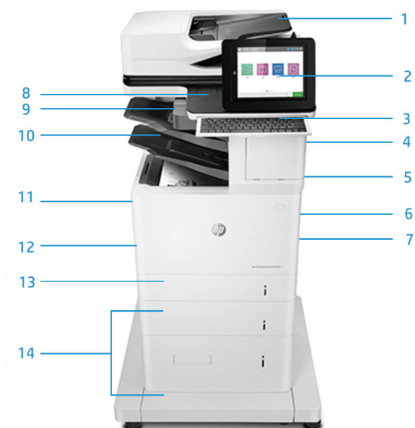
HP LaserJet Enterprise Flow MFP M633z shown