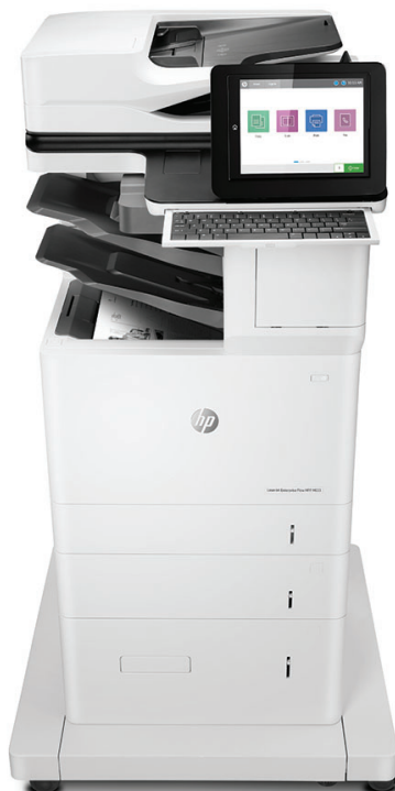
HP LaserJet Enterprise Flow MFP M633z