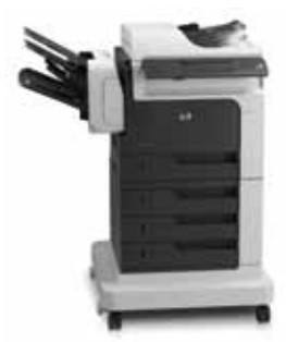
(HP LaserJet Enterprise M4555fskm MFP)