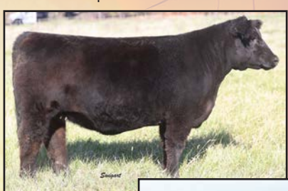
Service Sire for Lots 18-20