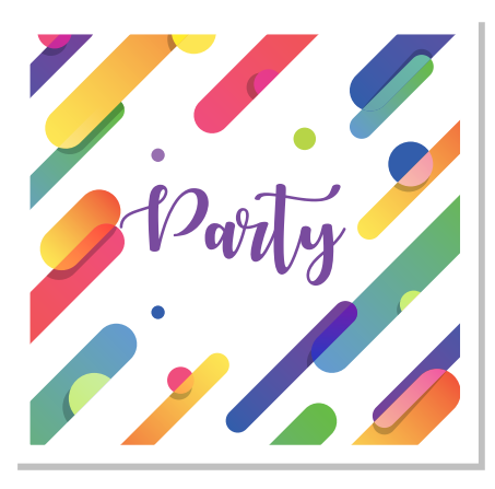
Pro9431E Four Colour Digital Printing (CMYK)