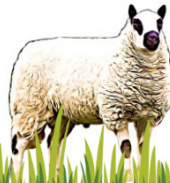
Kerry Hill Sheep